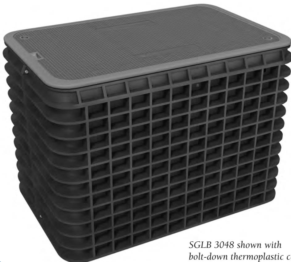
SGLB 3048 shown with bolt-down thermoplastic cover

Meets and is qualified to Telcordia GR-902-CORE specifications. Complies with the applicable elements of ANSI /SCTE 77 2002, for greenbelt placement.