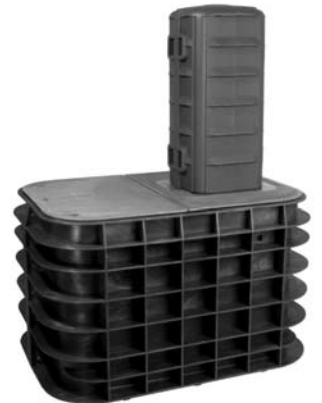
FTTP SGLB system with MGF1010 housing mounted on SGLB2436 split cover (plug removed).