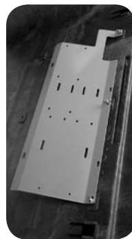
Sidewall Mounting Plate