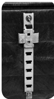
Step Rack w/Universal Mounting Bracket