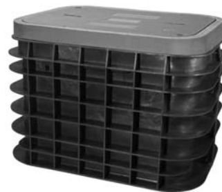
SGLB2436 box shown with polymer concrete ring and cover installed.