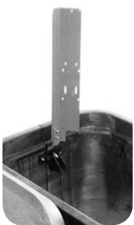
Fiber Tap Mounting Plate