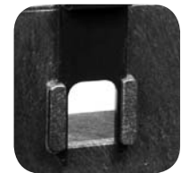
Winterized Drop Door (2 places)