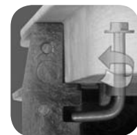
"L" Bolt Security Latching System