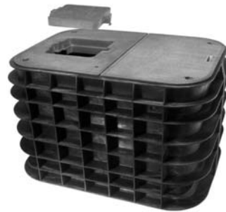
SGLB2436 box shown with split thermoplastic cover and removable plug.