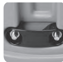
Self-locating Cover Security Lock Receiver