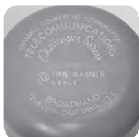
Private Label (A4 Shown)