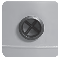
Winterized Drop (A1 Shown)