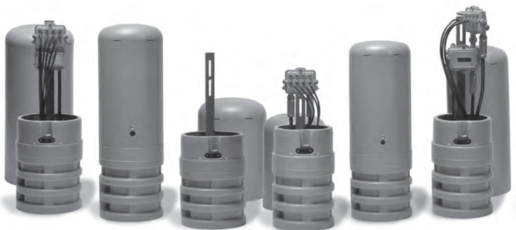
Challenger Pedestal Housing Series

A special self-locating cover ensures that the pedestals lock properly without requiring special alignment. The covers utilize Channell's proven Self-Lock® security hardware and tools used on all installed Challenger pedestals.