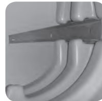
42" Joint Trench Stake P/N ST01001 (2 per ctn.)