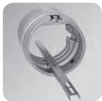
Stake (S2 Shown)